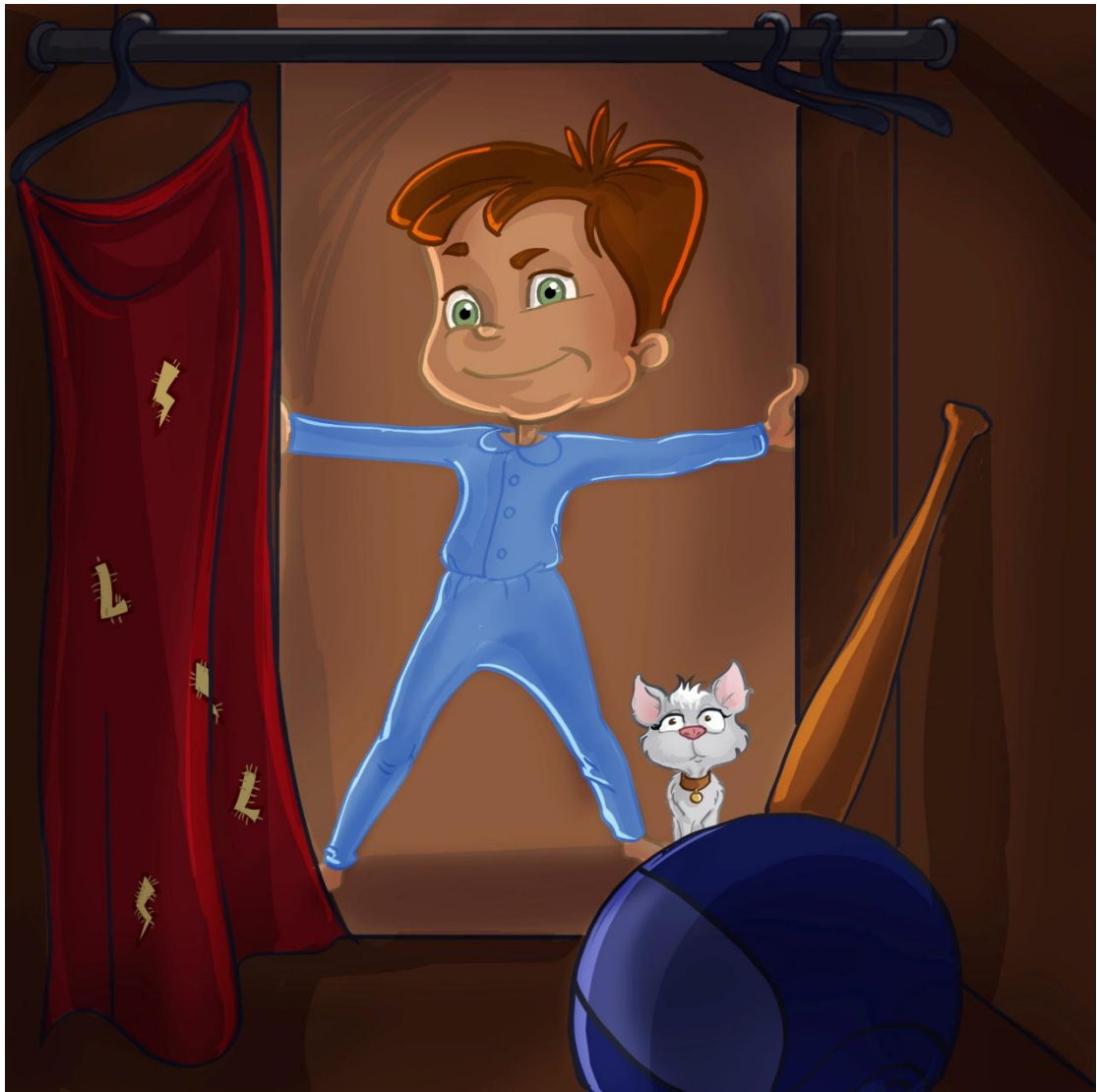
Leo gets up, goes to his closet, opens up the closet and takes out his superhero outfit.